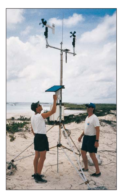
Meteorological conditions affecting marine larvae distribution are monitored at Exuma Cay, Bahamas.

Data is output in a choice of units (e.g., wind speed in miles per hour, meters per second, or knots). Standard outputs include wind vector averaging, sigma, theta, and histograms.