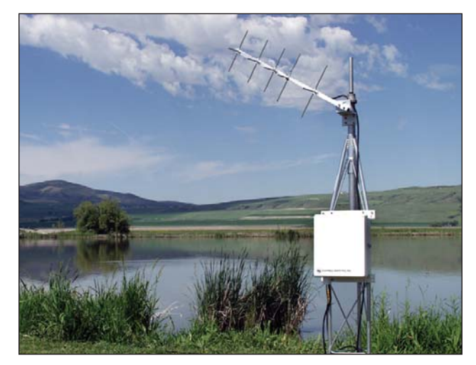
Our GOES transmitters are used for stream stage (shown), water quality, and rainfall applications.

Our NESDIS-certified GOES satellite transmitter provides one-way communications from a Data Collection Platform (DCP) to a receiving station. We also offer an Argos transmitter that is ideal for high-altitude and polar applications and a METEOSAT transmitter for European applications.