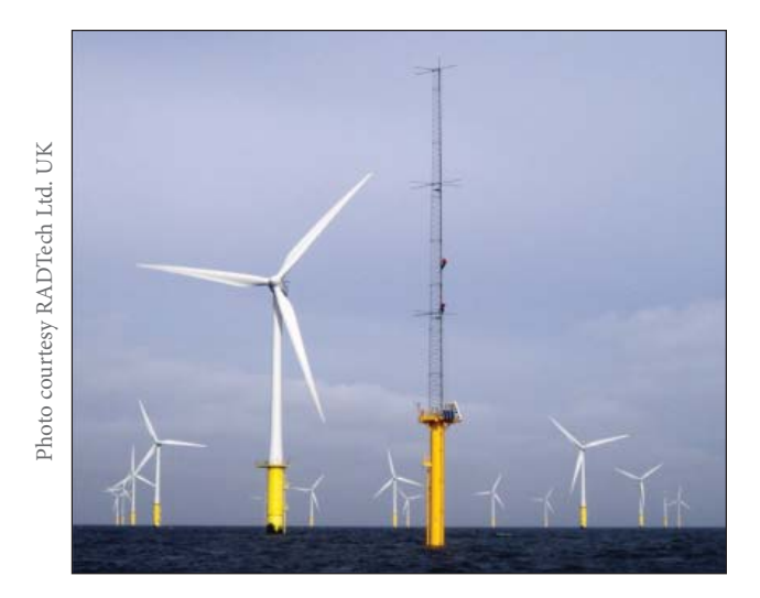
A Campbell Scientific datalogging system monitors this offshore wind farm located between Rhyl and Prestatyn in North Wales at about 7 to 8 km out to sea.

For turbine performance applications, the CR800 series monitors electrical current, voltage, wattage, stress, and torque.