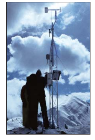
Data measured by this weather station near Aspen, Colorado is used in avalanche forecasting.